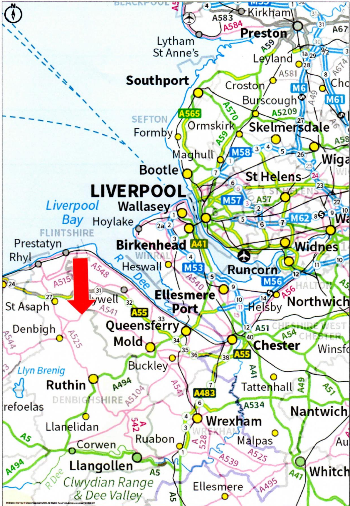
For identification purposes only and not to scale. Based upon the Ordnance Survey Map with the permission of the Controller of Her Majesty Stationary Office, Crown Copyright reserved. Celt Rowlands & Co – Licence No: 738380E000

Misrepresentation Act 1967. These details are provided as a general guide as to what is being offered subject to contract and subject to a lease being available and are not intended to be construed as containing any representation of fact upon which any interest party is entitled to rely. Other than this general guide neither we nor any person in our employ has any authority to make, give or imply any representation or warranty whatsoever relating to the property in these details